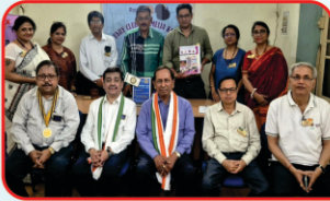
AG & ZS Club Official Visit on 18-03-2025