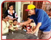
SNID Pulse Polio Immunisation Day observed on 16-02-2025 at Milan Mandir, Belegkata, where 29 Children were immunised & given a token of gift to the Children.