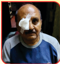
Sukho-Dristi-13, On 11-03-2025, Successfully operated 17 nos IOL cataract Surgeries at Shusrut Eye Foundation & Research Centre. It's our 4th no Cataract surgeries project, where 79 beneficiaries in total were operated in this Magical Rotary Year.