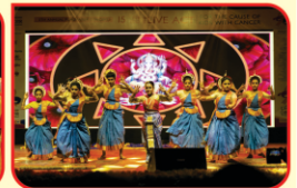
LIVE ACT, 15th February, 2025 at Rabindra Sadan , Fight Against Padiatric Cancer 5th Annual Fund raiser Concert, where RC Amelia Kolkata were Associate Co Host of this Event.