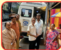
Sukho-Dristi-12; on 02-03-2025, 150 nos beneficiaries checked their Eyes For Supporting Healthy Vision Eye Wellness Check Up & Free Distribution of Spectacles Camp at Challabagan, Kolkata,